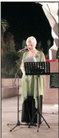
MEP Eleni Theocharous