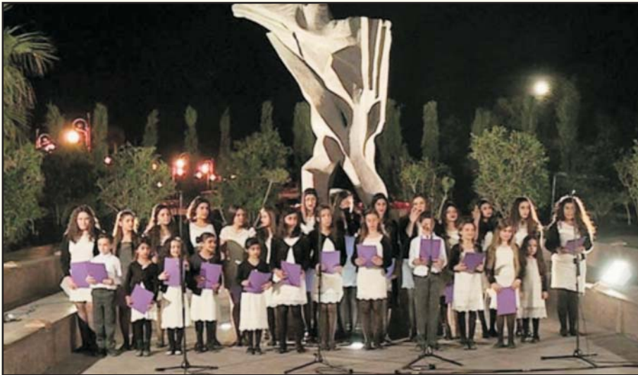
The "Angelic Voices" choir